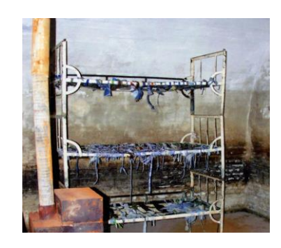
Prison cell with bunk-beds with no mattress, prisoners were obliged to sleep on. Stove for show only, never heated in cold winters.