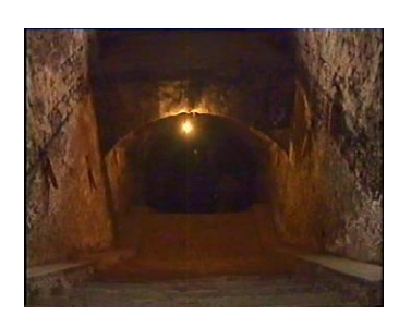
The Communist Jilava Prison. Entrance to the underground cells.

Valiant-for-Truth, the virtue described in the book "Pilgrim's Progress" shows again in communist countries. Let us be valiant, too, and help it shine!