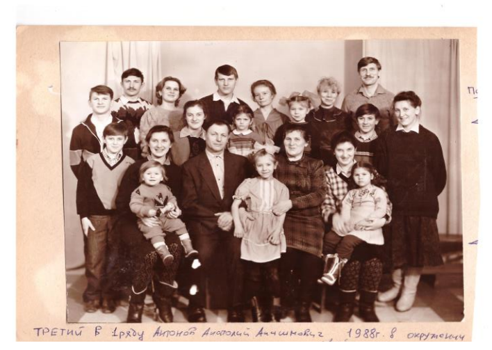
Persecuted Christians Helped with your Gifts