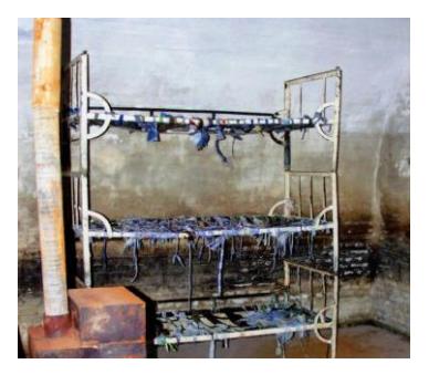
Prison cell with bunk-beds with no mattress, prisoners were obliged to sleep on. Stove for show only, never heated in cold winters.