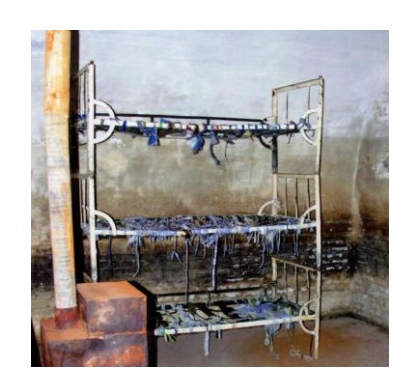
Prison cell with bunk-beds with no mattress, prisoners were obliged to sleep on. Stove for show only, never heated in cold winters.