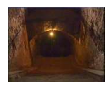
The Communist Jilava Prison. Entrance to the underground cells.