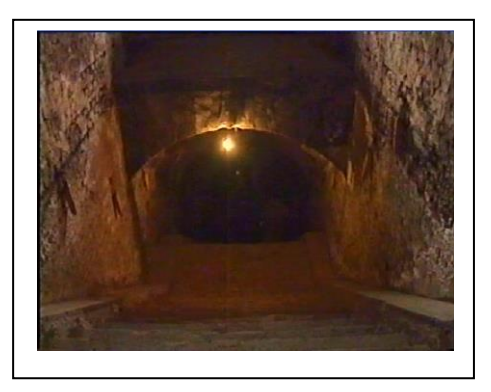
The Communist Jilava Prison. Entrance to the underground cells.