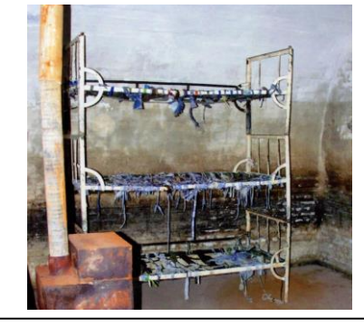
mattress, prisoners were obliged to sleep on. Stove for show only, never heated in cold winters.