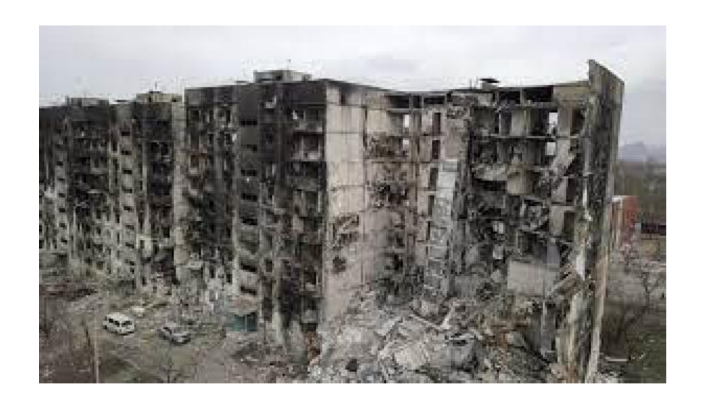
Examples of Christian Refugee Families from War-Torn Ukraine, Helped with your Gifts.

Over 8 million refugees have escaped so far from Ukraine into different European countries.