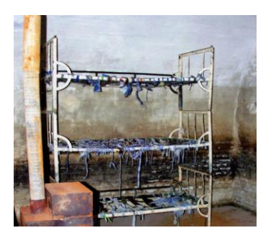
Prison cell with bunk-beds with no mattress, prisoners were obliged to sleep on. Stove for show only, never heated in cold winters.