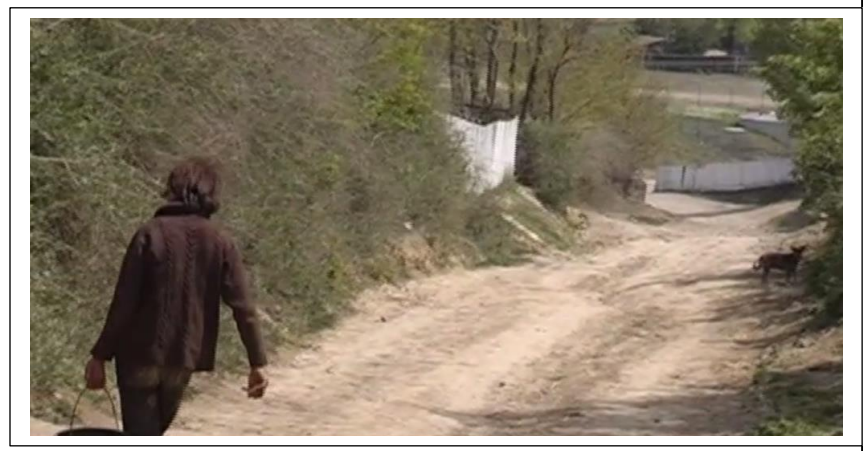
Some Romanian villages families still rely for their water on common wells. Pails of water for each household are carried by hand.

year the amount of money a Danish teacher earns in a month or a Luxemburg teacher in 2 weeks. The average monthly salary of a Romanian teacher is about $300 while prices of goods in stores are at the level of Western Europe! This Christian School was started in 1995 with the vision to bring the light of the Gospel into the spiritual darkness of the Romanian society. The spiritual darkness can be seen from the fact that recently one million pilgrims came to Iasi to worship the bones of a local saint.