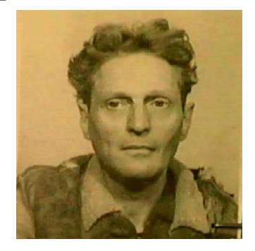
Mug shot of Late Reverend Wurmbrand when held in Jilava.