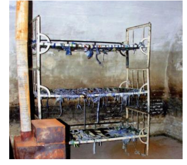
Prison cell with bunk-beds with no mattress, prisoners were obliged to sleep on. Stove for show only, never heated in cold winters.