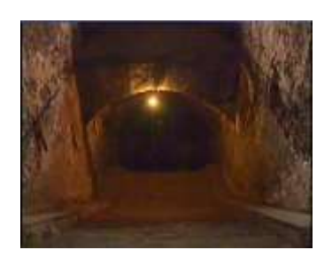
The Communist Jilava Prison. Entrance to the underground cells.