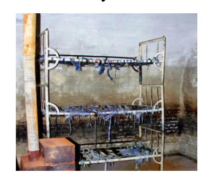
Prison cell with bunk-beds with no mattress, prisoners were obliged to sleep on. Stove for show only, never heated in cold winters.