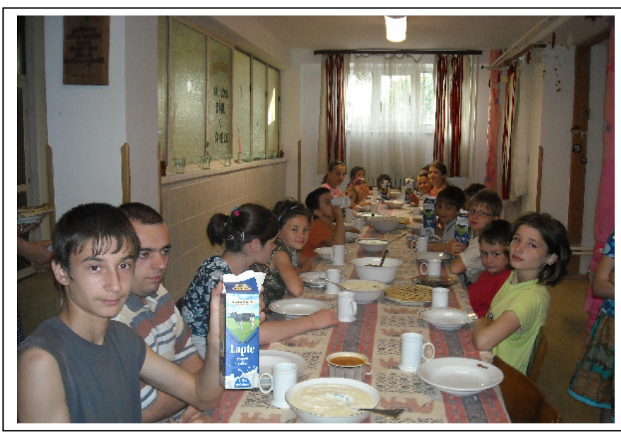
Agape Orphanage, Eating Hall