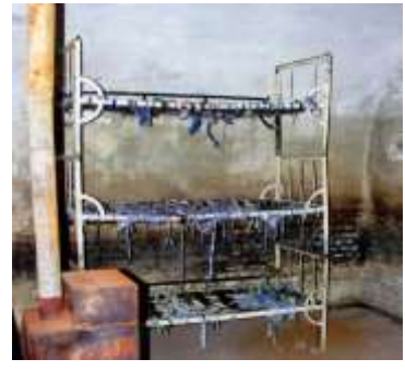
Prison cell with bunk-beds with no mattress, prisoners were obliged to sleep on. Stove for show only, never heated in cold winters.