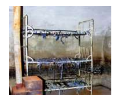
Prison cell with bunk-beds with no mattress, prisoners were obliged to sleep on. Stove for show only, never heated in cold winters.