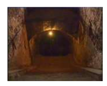
The Communist Jilava Prison. Entrance to the underground cells.

Today it seems that the sad news everywhere is: "Christians defeated." but when the cloud passes, we will see that Christians defeated many "isms", like communism, socialism, Marxism.