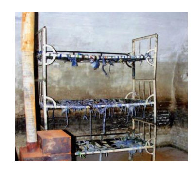
Prison cell with bunk-beds with no mattress, prisoners were obliged to sleep on. Stove for show only, never heated in cold winters.