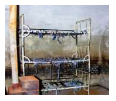
Prison cell with bunk-beds with no mattress, prisoners were obliged to sleep on. Stove for show only, never heated in cold winters.