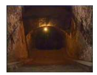
The Communist Jilava Prison. Entrance to the underground cells.

The Bible writes: "Remember them that are in bonds, as bound with them ; and them which suffer adversity, as being yourselves also in the body ." (Hebrews 13:3)